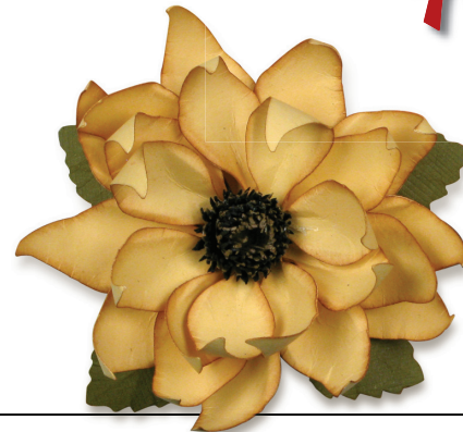
Photo images are for technique demonstration only. Flower petals may not match this project.